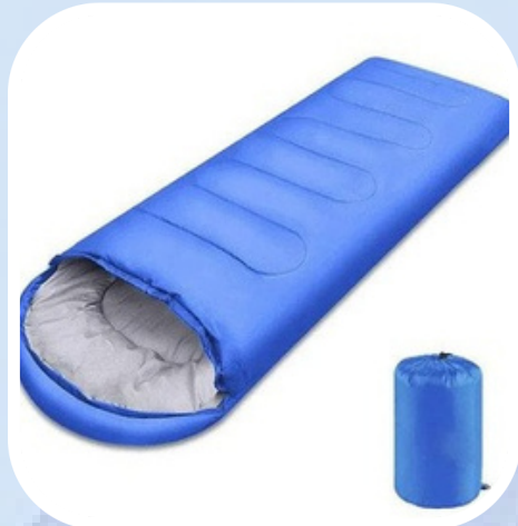
COLD WEATHER GRADED SLEEPING BAG