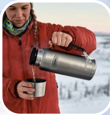
HOT WATER THERMOS