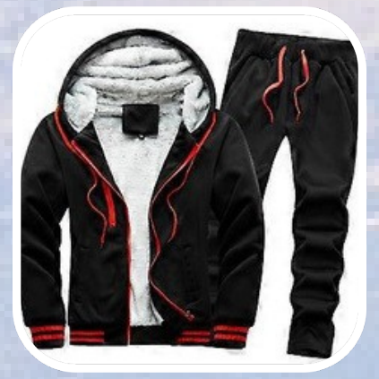
WARM JACKETS /TROUSERS