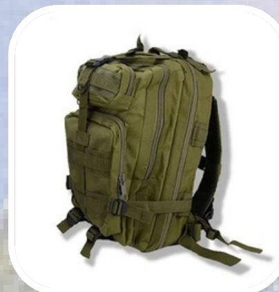
DAY BAG PACK