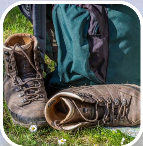
HIKING SHOES PREFERABLY 2 PAIRS