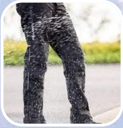
WATER PROOF TROUSERS