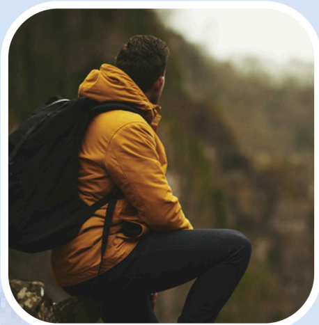
WARM WATERPROOF JACKET