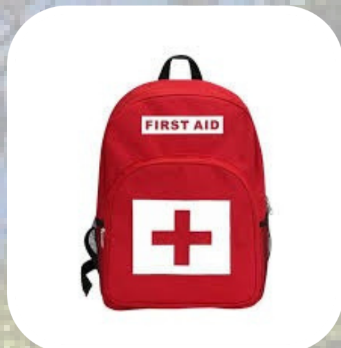
CARRY YOUR EMERGENCY MEDICINE BAG