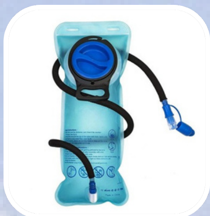
WATER BOTTLE/CAMEL BAG